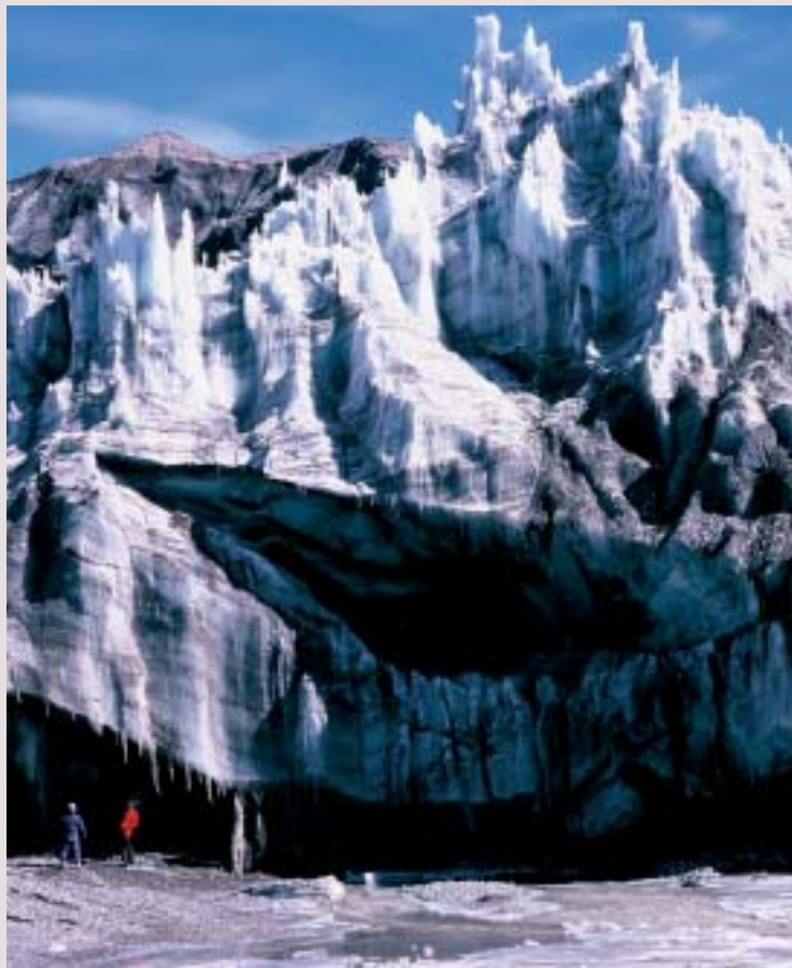
FIGURE 5 A huge ice cave in the Siachen Glacier—a striking visible reminder of the impact of global warming, another major anthropogenic source of risk.

The concept of a Transboundary Peace Park fits in completely with these suggestions, giving a positive dimension to the process. It would work not only toward disengagement but also toward the creation of a park to protect the environment—to allow the ibex, the snow leopard, and the wild roses to return. An informal group of the World Commission on